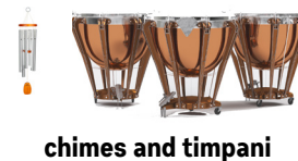
chimes and timpani