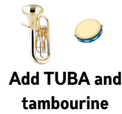
Add TUBA and tambourine

Melodic phrases go between TUBA and other sections