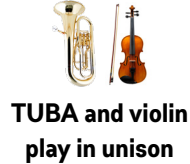
TUBA and violin play in unison