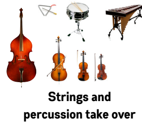
Strings and percussion take over