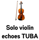
Solo violin echoes TUBA